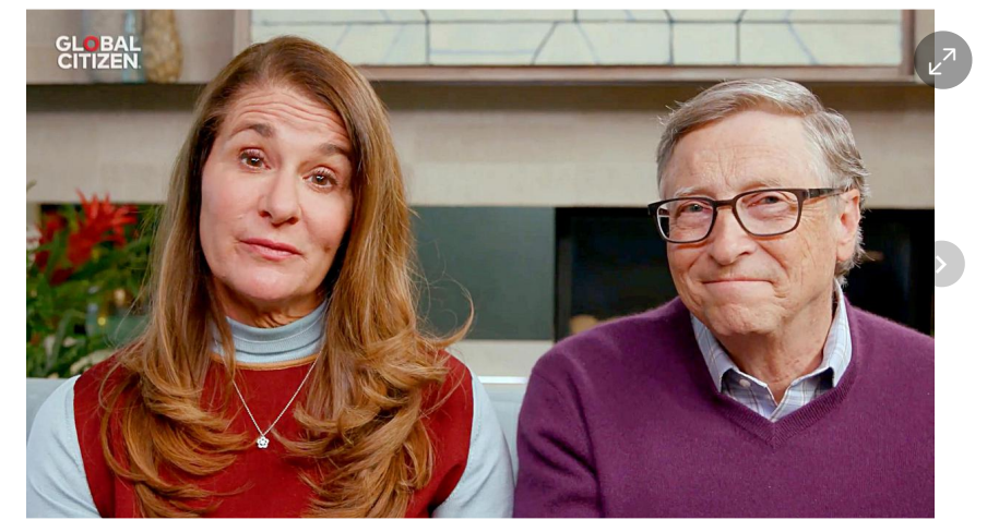
Melinda French Gates and ex-husband Bill.