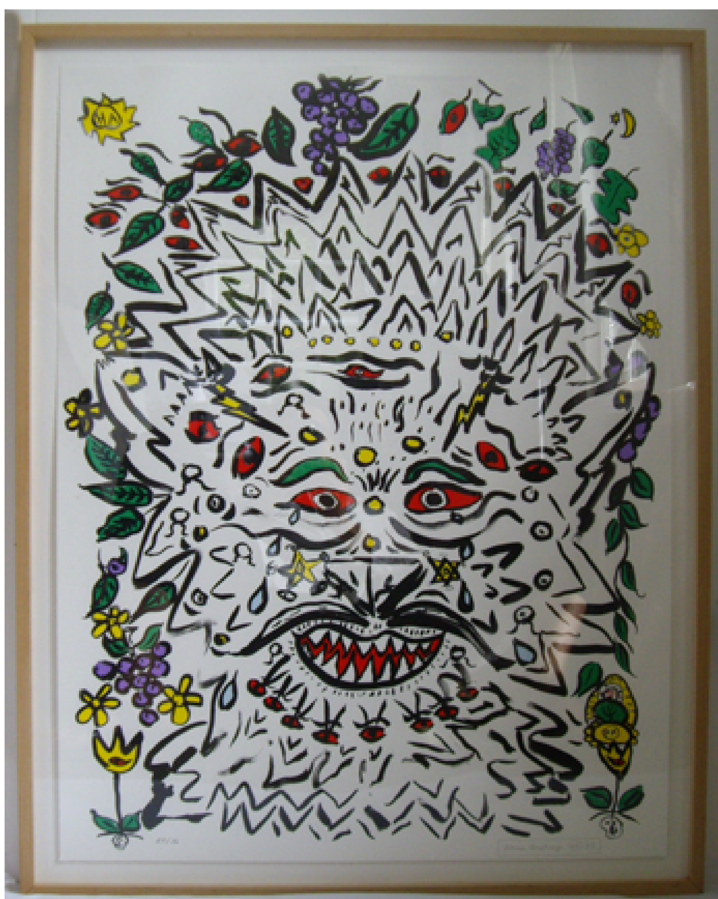
Untitled #3, 1998 – Allen Ginsberg – lithograph & screen print via Gemini G.E.L.